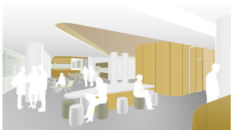
Wallace Wurth Redevelopment for the Faculty of Medicine, UNSW.