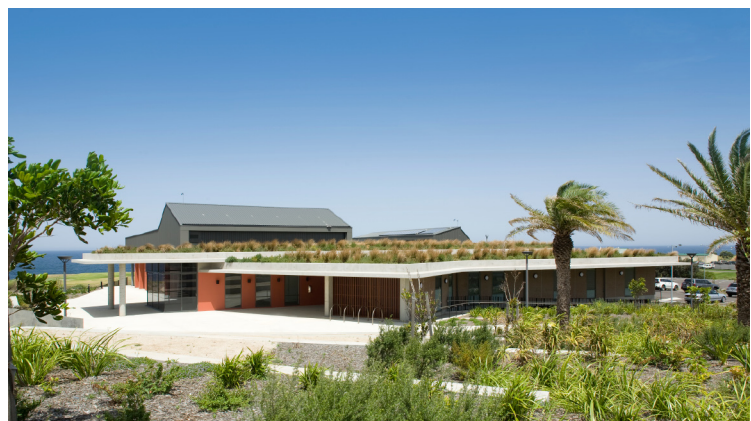
Prince Henry Community Centre

Five luxury beach houses at Elysium Noosa, for Pearson Property Group