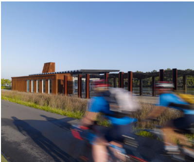
Armory Wharf Cafe, Sydney Olympic Park