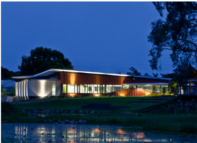
Ingham Cultural Centre and Library