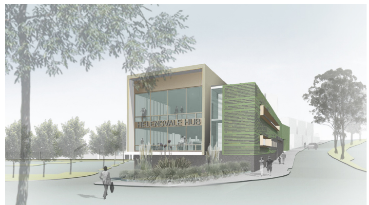
Helensvale Library and CCYC

Green Square, Sydney - 'The Linc' residential apartments - $32 Mil