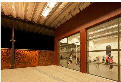
Ropes Crossing Community Centre