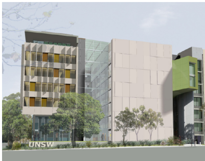
Wallace Wurth Redevelopment University of NSW