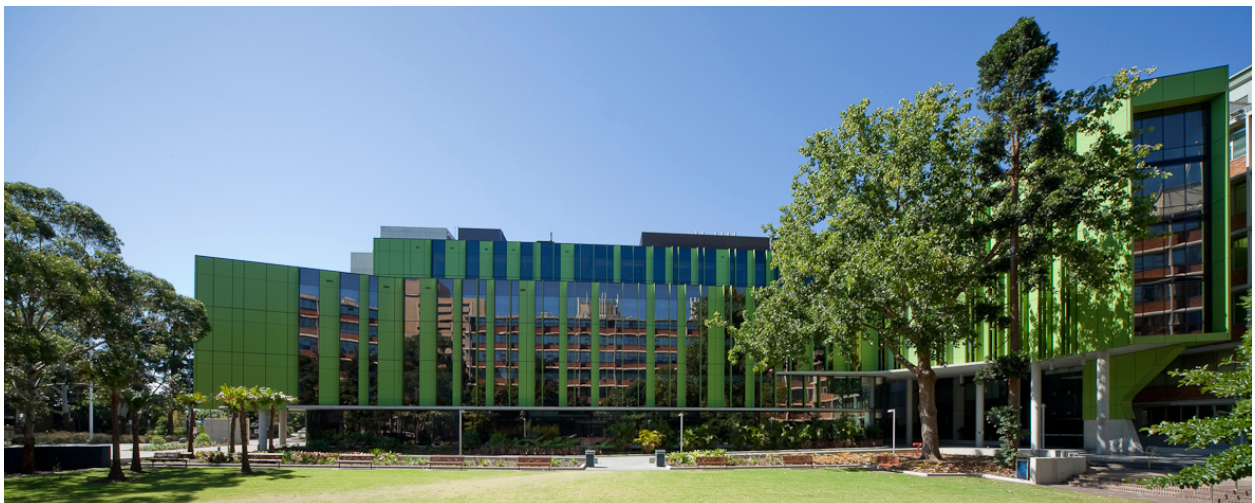
Lowy Cancer Research Centre, University of New South Wales