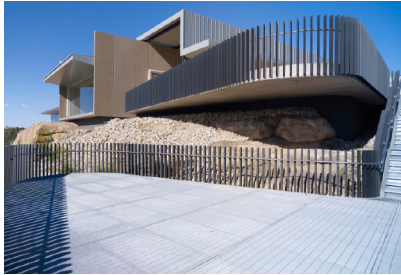
Warragamba Visitors' Information Centre, Sydney Catchment Authority